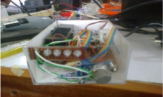
Figure-1.5b: Summary view of the Circuit