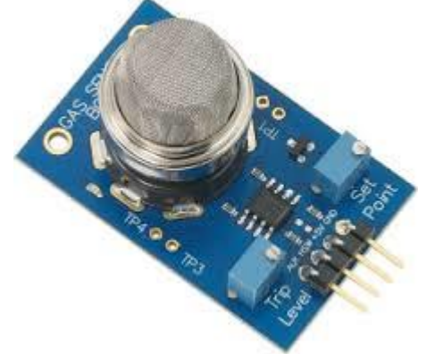
Figure-1.2: MQ-9 Sensor

This DC output of 5V is where other components tap from. First, is the gas sensor (MQ-9), then ATMEGA328P microcontroller, and most importantly, the alarm systems (the four (4) red led and sounder) and other components as the resistors and capacitors. The gas detector with audible alarm system is designed with the intention to ensure that the event of gas is intelligently detected, promptly notified and interactively managed than what is obtainable with conventional ring-ring fire alarm systems. For detecting the event of Liquefied Petroleum Gas LPG, MQ-9 sensor was used because from datasheet they are used in gas detecting equipment. Also it is known for its low cost and long life span. The MQ-9 have 6 pin, 4 of them are used to fetch signals, and other 2 are used for providing heating current. The sensor works with voltages between 5V and 12V AC or DC. A 5V supply voltage was used for this design. Once powered, the output of the sensor is normally HIGH but goes LOW when gas is sensed. The diagram of the MQ-9 is as depicted in figure 1.2.