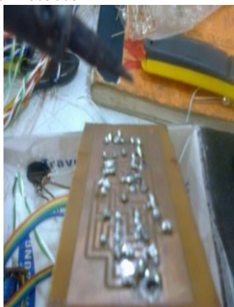
Figure-1.5a: Component layout on Vero-board

Figure-1.4: Solder-less Experimentation of the Gas Detector