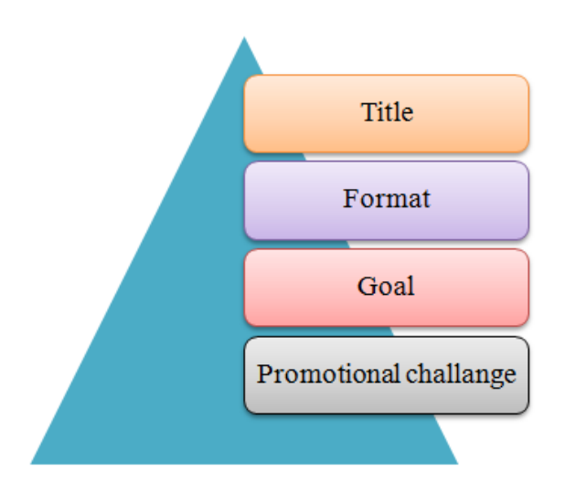
Figure 2: Content creating plan