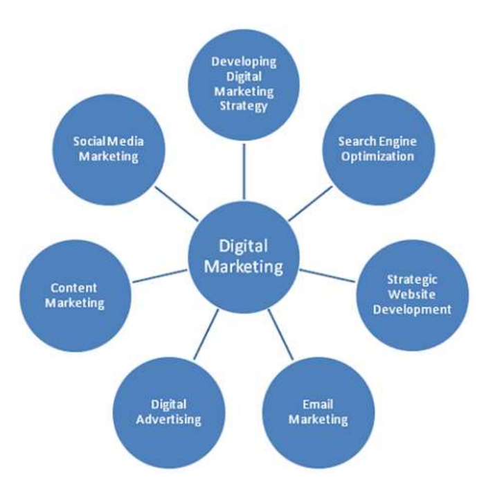
Figure 1 Steps for digital marketing